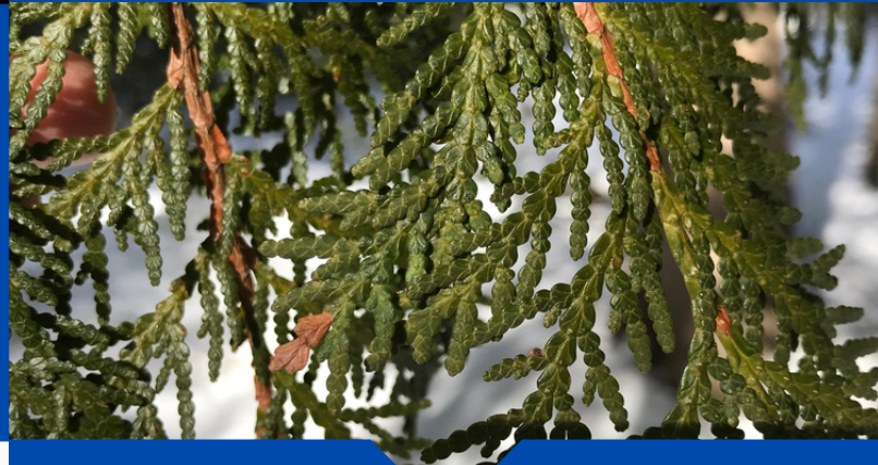
JUNE IS WÍPAZUKŇA WAŠTÉ WÍ – MOON OF GOOD BERRIES. OUR ANCESTORS WOULD GAUGE SEASONS BY THE TYPES OF FOOD THEY COULD FIND. DURING THIS MOON, THE BERRIES ARE FRESH, TASTY AND RED.

THIS SPECIAL PLANT IS USED TO CLEANSE AWAY NEGATIVITY. WHEN YOU BURN THIS PLANT, IT MAY REMIND YOU OF THE PAHÁ SÁPA.